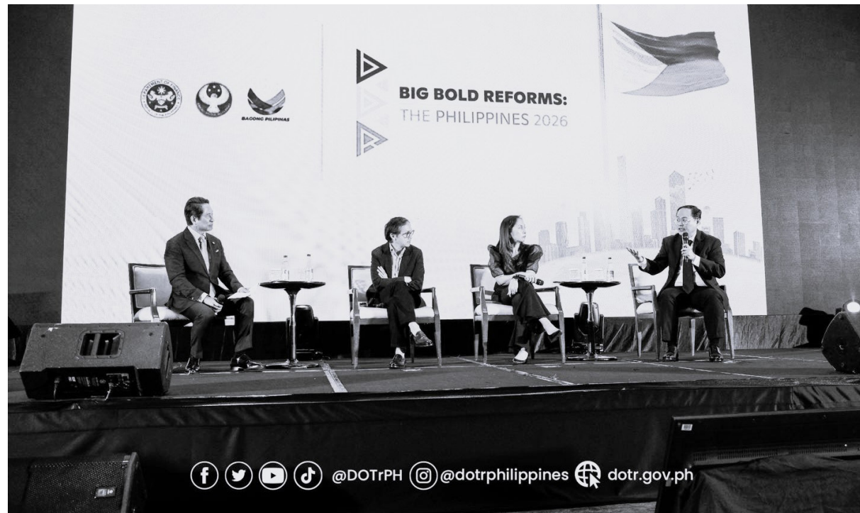
Facebook, Twitter, YouTube, TikTok, Instagram, LinkedIn, @DOTRPH, @dotrphilippines, dotr.gov.ph

Transportation Secretary Giovanni Lopez on Friday vowed to speed up the construction of big ticket transport projects and resolve issues such as right-of-way to improve the country's transport systems and enhance the Philippines long-term competitiveness. President Ferdinand Marcos Jr. has ordered the Department of Transportation (DOTr) to expedite the completion of these projects. Secretary Lopez explained that expediting the construction of transport projects means having to "ramp up spending to ensure that these projects will truly benefit the Filipino people." "Lahat po ng pondong inilaan para sa mga imprastruktura, diretsong mapakikinabangan ng mga Pilipino," Secretary Lopez said during the Big Bold Reforms Economic Forum organized by the Department of Finance (DOF) and Bangko Sentral ng Pilipinas. According to the transport chief, the DOTr construction of transport projects in 2025 has an allotted